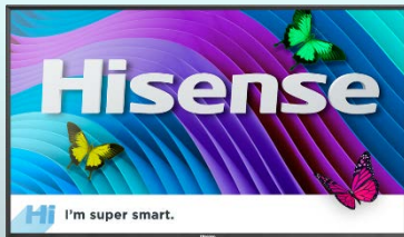
55 Inch Hisense Smart 4k (2160p) UHD HDR TV

4 Grand Prizes - $1,600 Total Value Over $15,000 in overall prizes